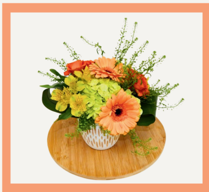
Radiant Delight $120.00 Flowers and vessel may vary