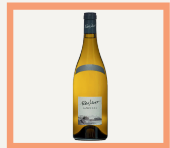
Pascal Jolivet SANCERRE Loire Valley, France $64 Marked by richness, elegance, and smoothness

All amenities are subject to added 17% gratuity and $5 delivery fee (excluding floral amenities)