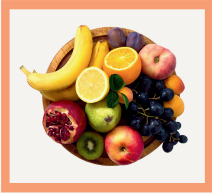
Seasonal Whole Tropical Fruits $32