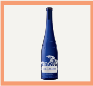
Mar de Frades ALBARIÑO Rias Baixas, Spain $60

High Acidity, vibrant citrus and stone fruits