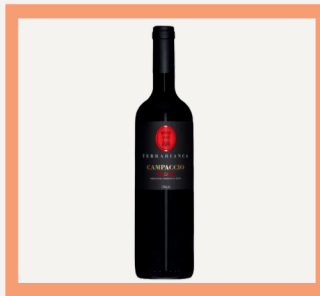
Terrabianca Campaccio SUPER-TUSCAN Tuscany, Italy $67

A fruit-forward California red blend with plush flavors of blue and black fruits, chocolate, and spice