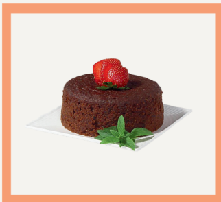
Traditional Bermuda Fruit & Rum Cake 5" $42