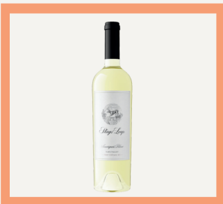
Stags' Leap SAUVIGNON BLANC Napa Valley, California $74 Assertive passionfruit and tropical fruit flavors with an abundant bouquet