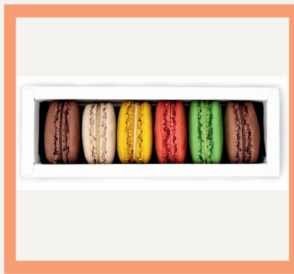
Assorted Macarons (6) $38