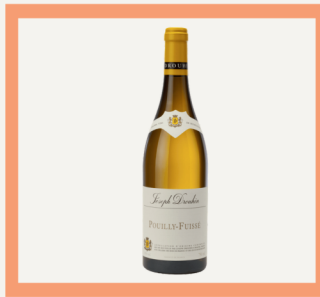
Joseph Drouhin POUILLY-FUISSÉ Mâconnais, France $72 Floral and fruity aromas, almond and ripe grapes dominate