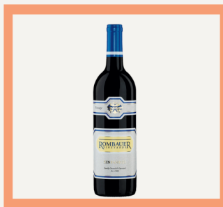
Rombauer ZINFANDEL Napa Valley, California $87

Blackberry and candied orange scents intertwine with notes of cinnamon and dark chocolate