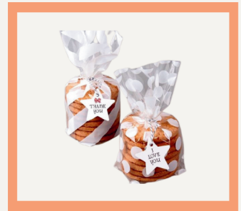
Assorted Cookies Paired with Bottled Water $22