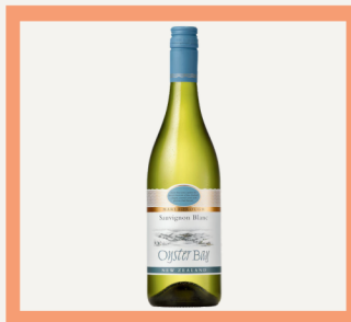
Oyster Bay SAUVIGNON BLANC Marlborough, New Zealand $62 Fresh citrus and tropical fruit with crisp acidity and a clean, vibrant finish