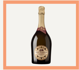
Santa Margherita PROSECCO Superiore Veneto, Italy $59 Peach, apple & acacia blossom