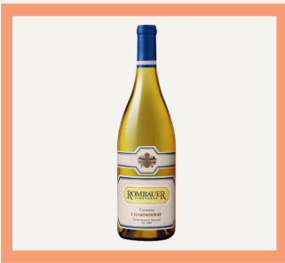
Rombauer CHARDONNAY Sonoma, California $79 Famously rich, full-bodied, and buttery with yellow peach, citrus, and toasted vanilla