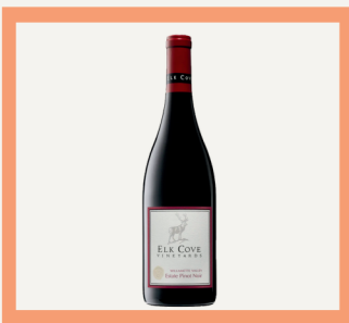
Elk Cove PINOT NOIR Willamette Valley, Oregon $73

Medium-bodied with delicate flavors of cherry, raspberry, and violet