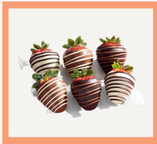
Chocolate Dipped Strawberries $31

Portions and pricing are based on a maximum of 2 guests. Surcharges apply for additional guests All amenities are subject to 17% gratuity and $5 delivery fee (excluding floral amenities) Minimum 24 hours advance time required but may vary for other items