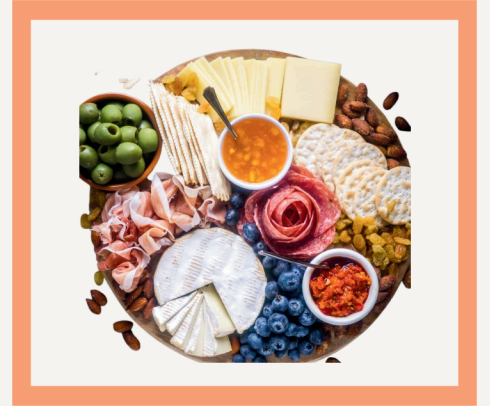
Charcuterie Board $62