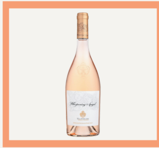
Château d'Esclans "Whispering Angel" Rosé Provence, France $58

High Acidity, vibrant citrus and stone fruits