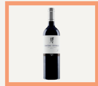
Château Teyssier Grand Cru MERLOT/CABERNET FRANC Saint-Émilion, Bordeaux, France $83

Sangiovese & Cabernet Sauvignon blend with unbelievable richness and complexity