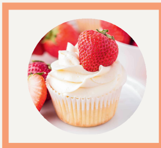
Strawberry Shortcake Cupcakes (6) $29