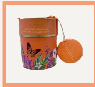
Love Bermuda Assorted Chocolate Truffles (17) $31 Milk chocolate with Rum and lime, dark chocolate with mint, milk chocolate with caramel, dark chocolate with chocolate ganache