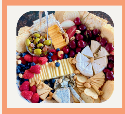
Gourmet Fruit, Cheese & Cracker Assortment $57 Without Fruit $47