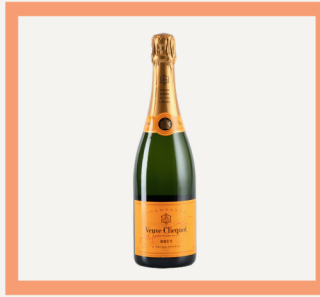
Veuve Clicquot BRUT Champagne, France $134 White cherry, biscuit, and honey