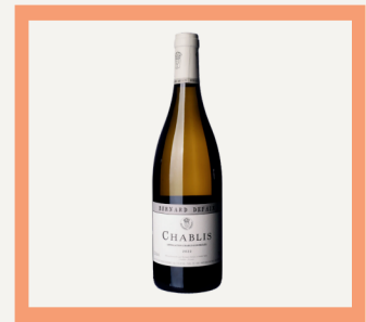
Bernard Defaix CHABLIS Burgundy France $61 Fresh citrus aromas and dry, fruity & with classic minerality