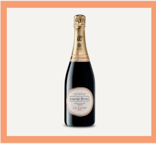
Laurent-Perrier "La Cuvée" BRUT - Champagne, France $115 Citrus, white flowers, and stone fruit