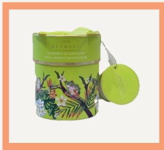
Love Bermuda Assorted Chocolate Truffles (17) $31 Dark chocolate with espresso, milk chocolate with coconut, dark chocolate with crisp, dark chocolate with Amaretto cheesecake