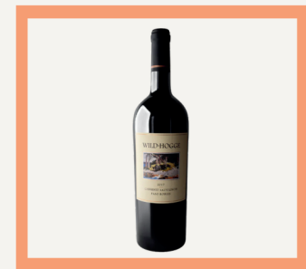
Wild Hogge CABERNET SAUVIGNON, Paso Robles, California (Exclusive to Bermuda) $79

Full-bodied, concentrated flavors of jammy black cherry, raspberry, and plum, accented by notes of clove, vanilla