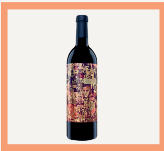
Orin Swift "Abstract" GRENACHE/SYRAH Napa Valley, California $94

Structured and rich with a beefy frame holding crushed plum, currant, and tobacco notes