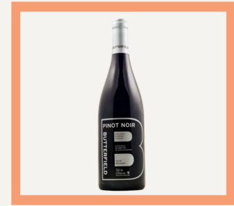
Butterfield PINOT NOIR, Burgundy, France (A Bermudian Winemaker) $79

Full of mouthwatering light fruit flavors with a clean finish